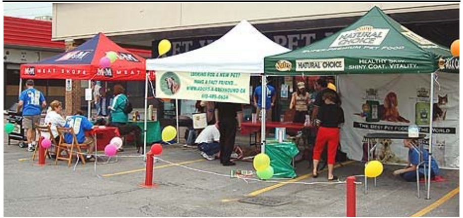
Pet Valu Barbeque benefits Adopt-A-Greyhound