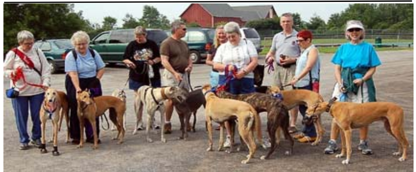
The 'Walkers and Talkers'

m.mcgrath7761@rogers.com or (613) 599-7761.